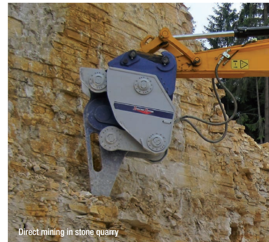
Direct mining in stone quarry