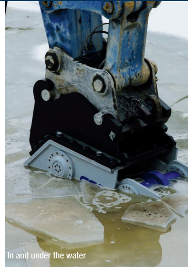
In and under the water