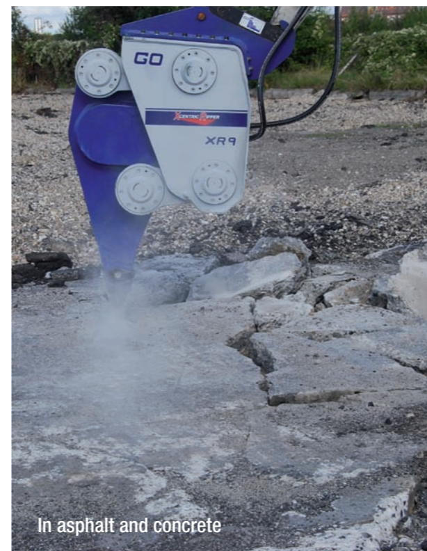
In asphalt and concrete